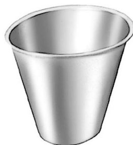
33. 23.90 ø 90 x 90 mm, height