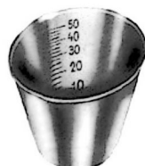
33. 22.50 50 cc