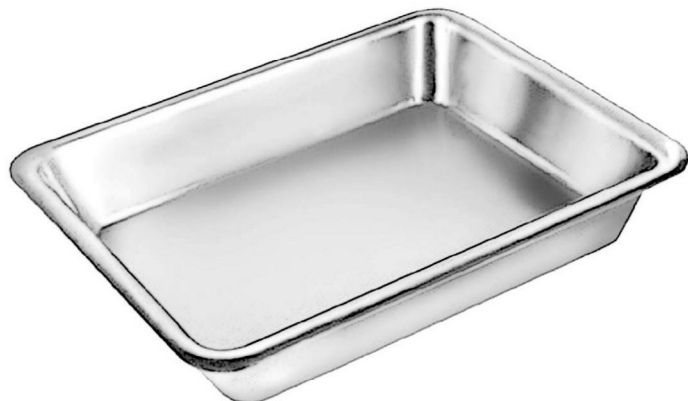
33.05.63 235 x 190 x 40 mm

L = Length W = Width D = Depth ø = Diameter