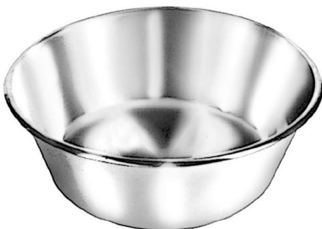
33.05.82 ø 200 x 70 mm